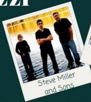
Steve Miller and Sons